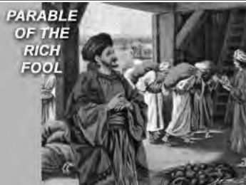
PARABLE OF THE RICH FOOL